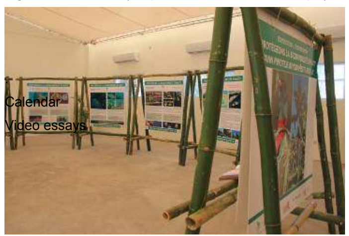
Fig 2: Haiti Biodiversity Expo in situ at Université Quisqueya, and Darwin Initiative acknowledgement.