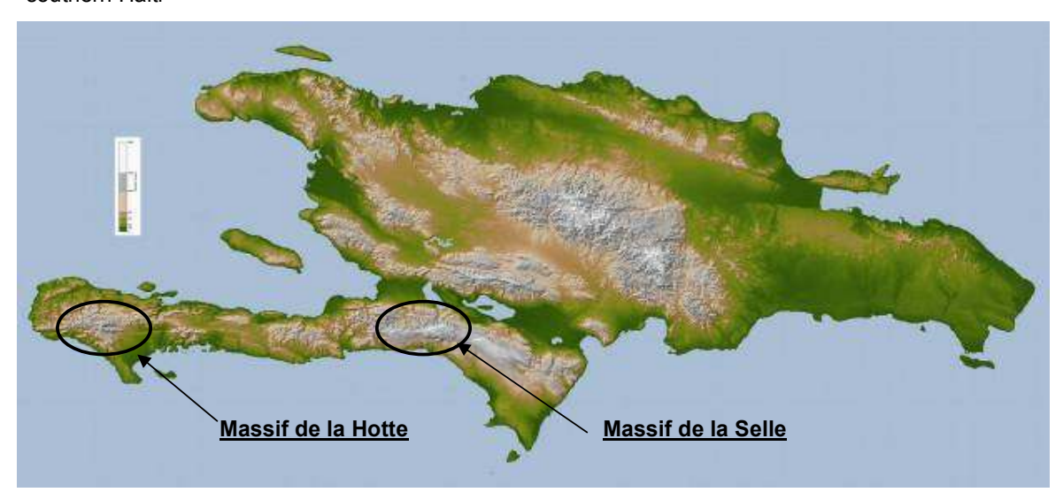
Fig 1: Darwin primary project area, Massif de la Hotte, and secondary project area, Massif de la Selle, southern Haiti

This project aimed to "Improve the conservation management and status of Haiti's globally threatened vertebrates and the integrity of the forest habitats they depend upon, within the key biodiversity area of the Massif de la Hotte" (see Fig 1). Minute areas of highly threatened forest remain, but to ensure that their unique biodiversity has a future, this project has drawn on UK biodiversity expertise to successfully build institutional capacity and strengthen critical skills in Haiti through experiential learning focused on field research, project planning, monitoring and management. Knowledge of Haiti's threatened vertebrates has been significantly enhanced and important discoveries made.